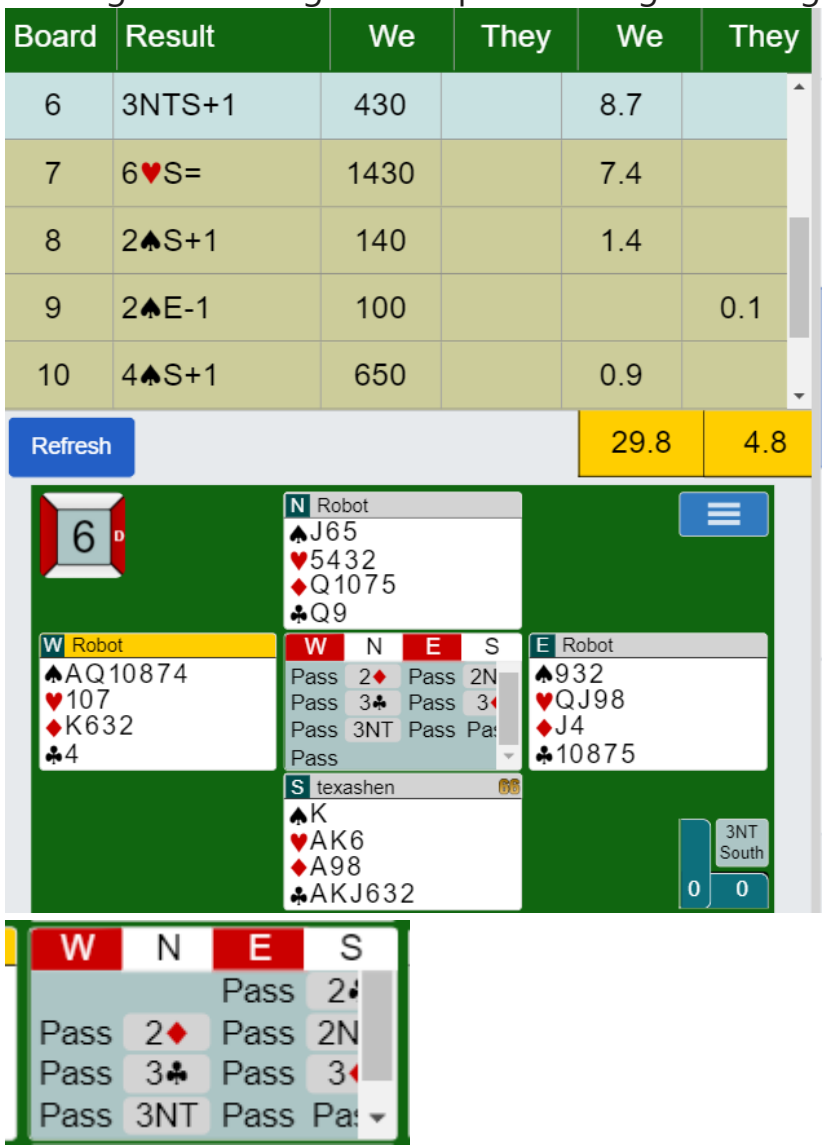
S 2C (22 hcp, 3 aces and a strong 6 card suit)

Bidding and making Notrump with a singleton King.