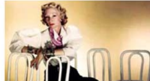
Millicent Rogers Museum

The hacienda was once an important trade center for the northern boundary of the Spanish Empire.