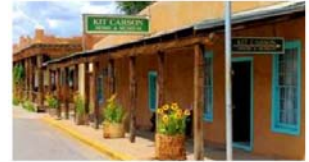
Kit Carson Home & Museum