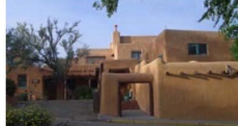
Harwood Museum of Art

These are the homes and studios of two founders of the internationally-known Society that established Taos as an art colony.