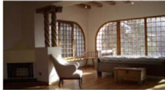
Taos Art Museum at the Fechin House

The museum is located in the home built by Russian artist Nicolai Fechin in 1927. It is half mile north of Taos Plaza