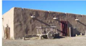
La Hacienda de los Martinez

The museum is located in the home built by Russian artist Nicolai Fechin in 1927. It is half mile north of Taos Plaza