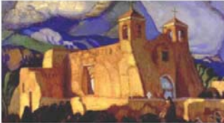
Blumenschein Home & Museum