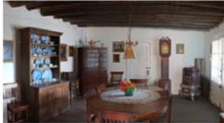
The Couse-Sharp Historic Site

E.L. Blumenschein is credited with starting the Taos Society of Artists and his home has become a shrine to his creative genius.